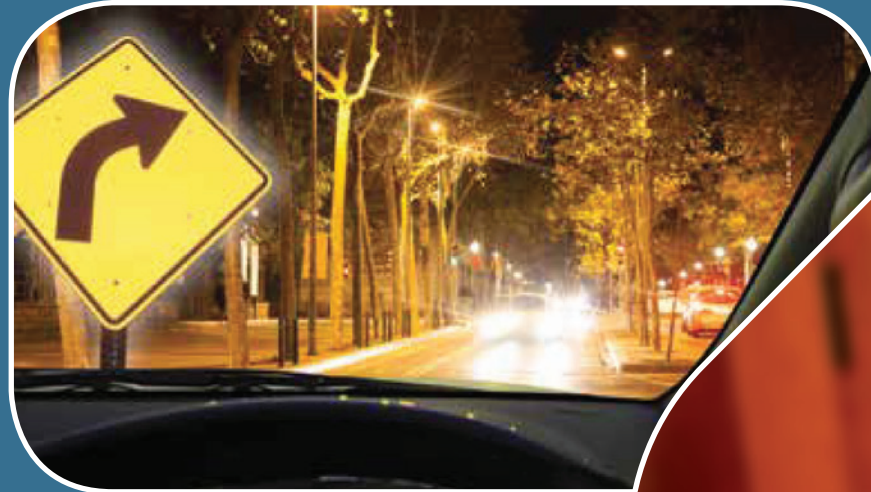
This picture demonstrates what glare (streetlights and car headlights) and halos (road sign and white stripe on the edge of the road) might look like.

Your brain is generally able to adapt and the glare and halos will become less noticeable over time. 7